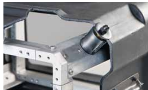
Shake it up: Rubber shock mounts keep equipment stable.

Whether you need one empty case or a run of engineered cases for an extreme application, Pelican has the right size and the right team to get it done. In addition to our primary manufacturing facilities in the USA and Europe, there's a regional Advanced Case Center near you ready to help. Just call 1-800-542-7344 and we'll get you the right case for the job.