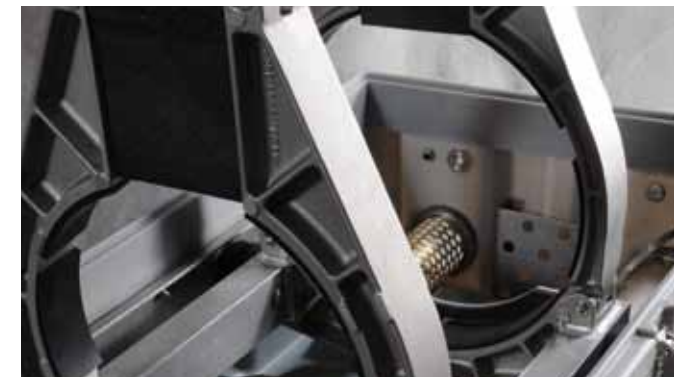
Extreme case work: Engineered cradles for secure transport.