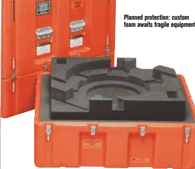
Planned protection: custom foam awaits fragile equipment.

Getting your equipment safely from point A to point B is paramount. To move your case around you might need wheels, or if the load is extreme we can install forklift spacers and a bash-plate. We can also help you with technical choices, such as standard or mil-spec purge valves (prevents vacuum lock in the event of altitude change). The list goes on: from handles and latches to desiccant chambers for removing humidity from the case. You'll find an overview of common accessories on page 25.